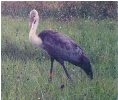
Wattled crane juvenile